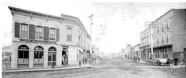
First Library 1890-1892