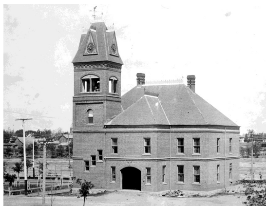
Second Library 1892-1948